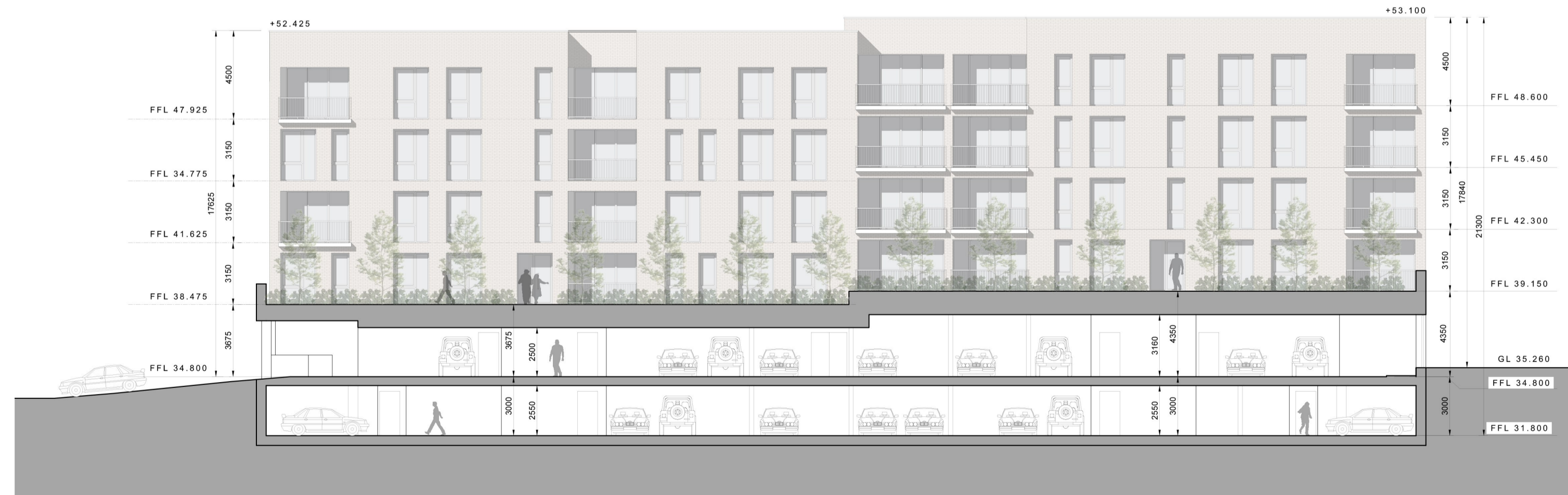
Section B:B with Internal West Elevation to Podium