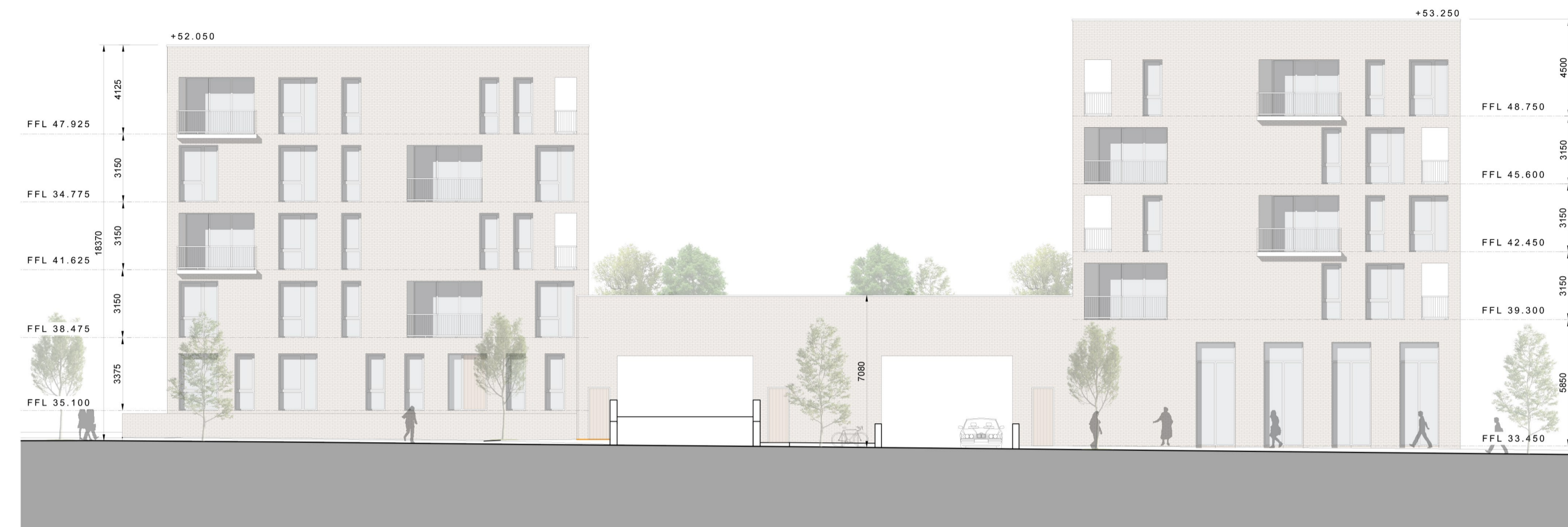
South Elevation - To Lane